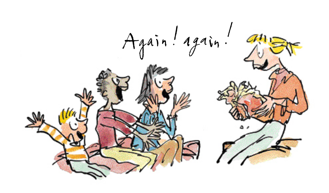
4 The right to read it again.