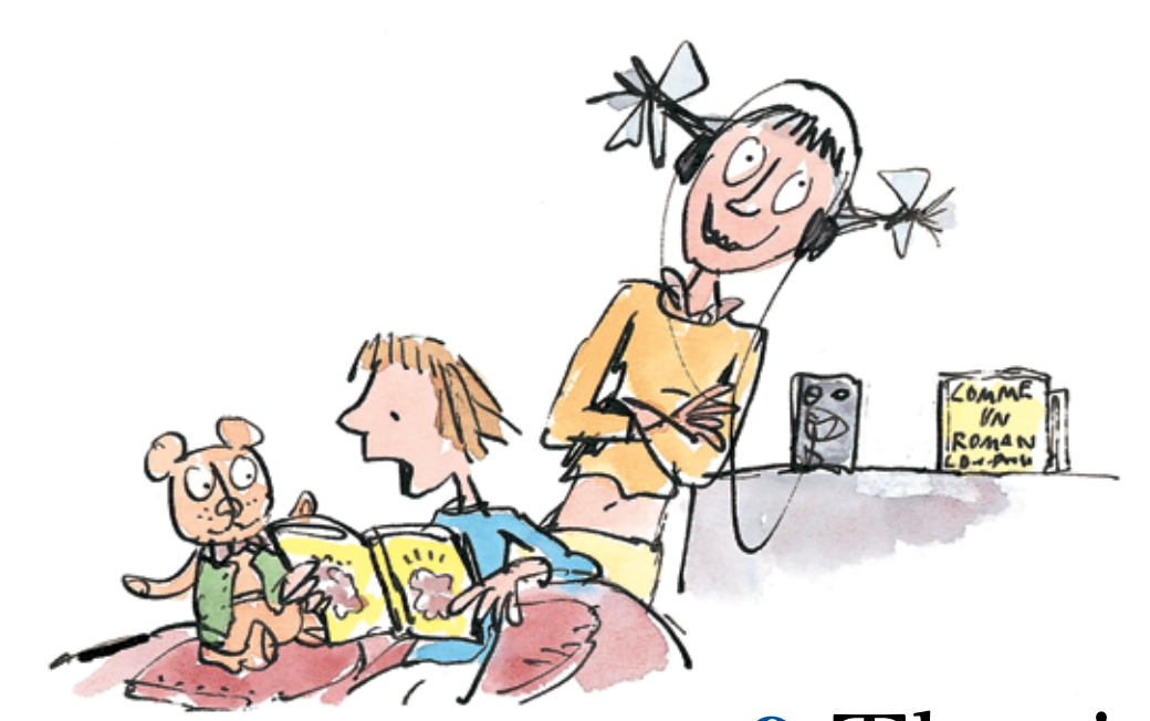
9 The right to read out loud.