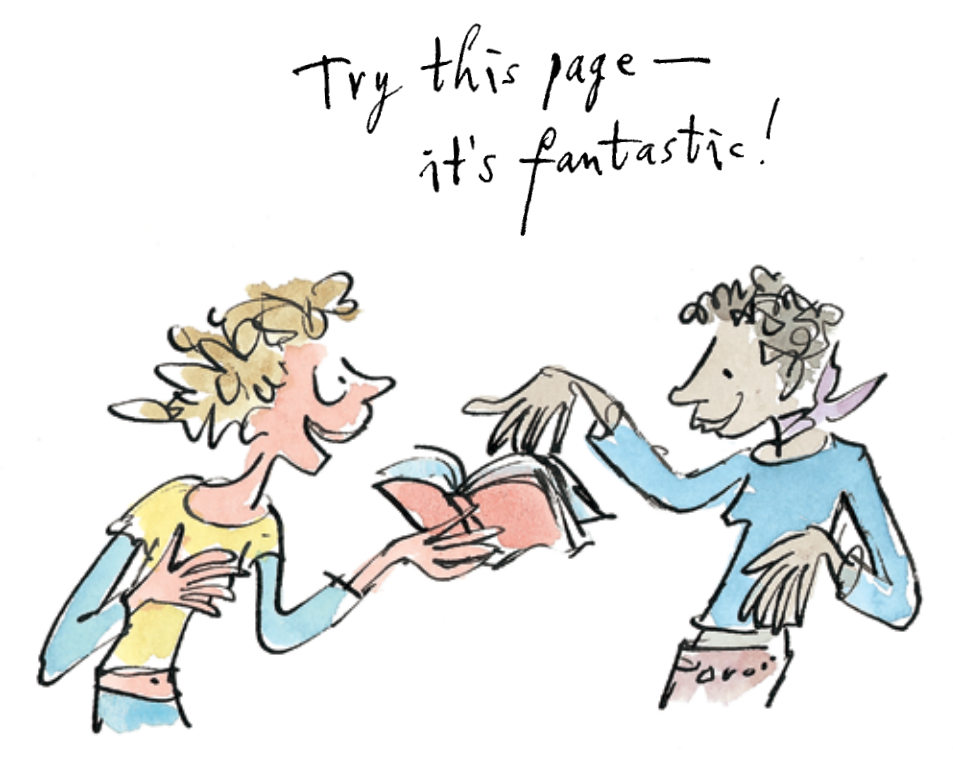
8 The right to dip in.