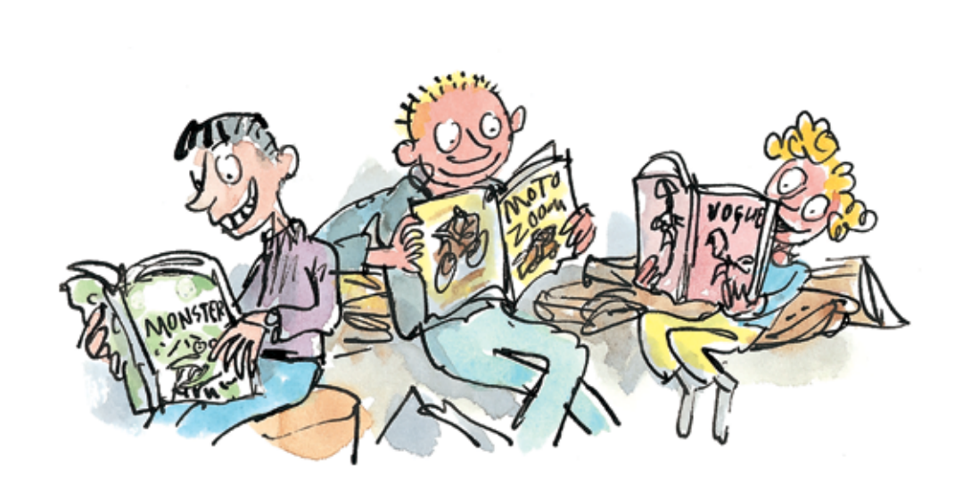
5 The right to read anything.