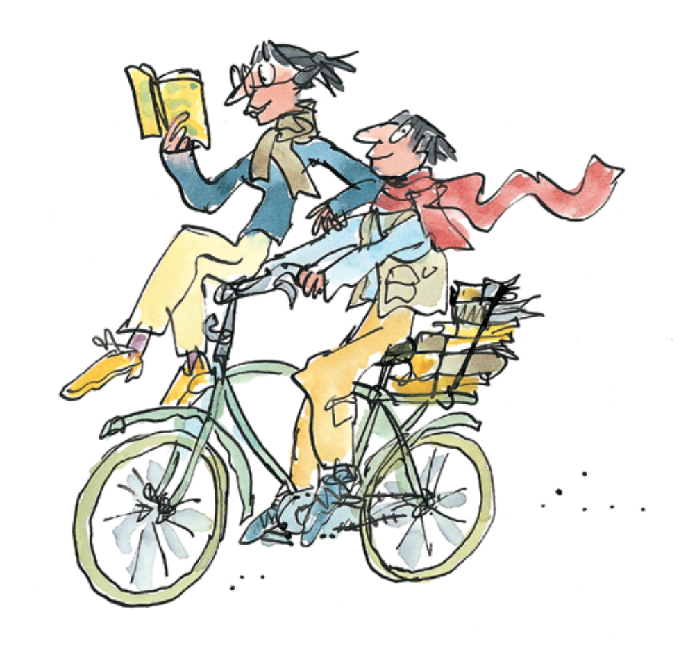
7 The right to read anywhere.