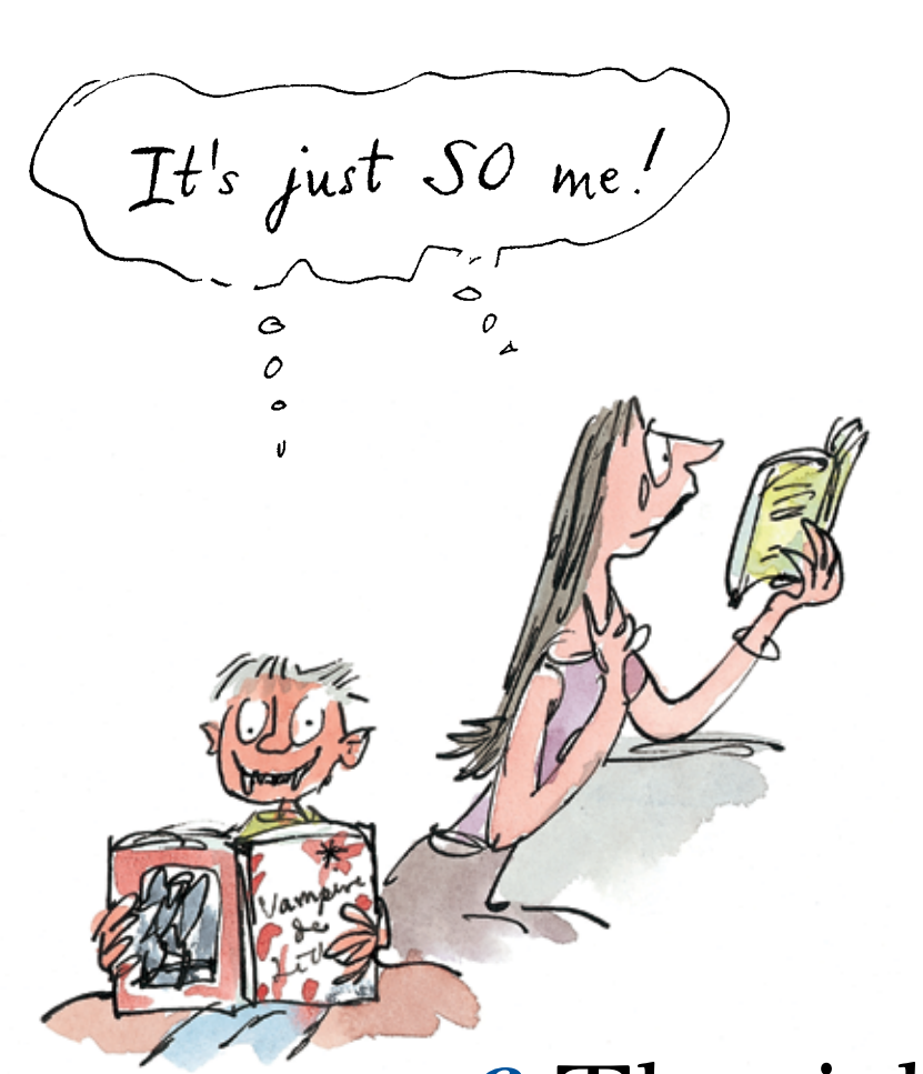
6 The right to mistake a book for real life.