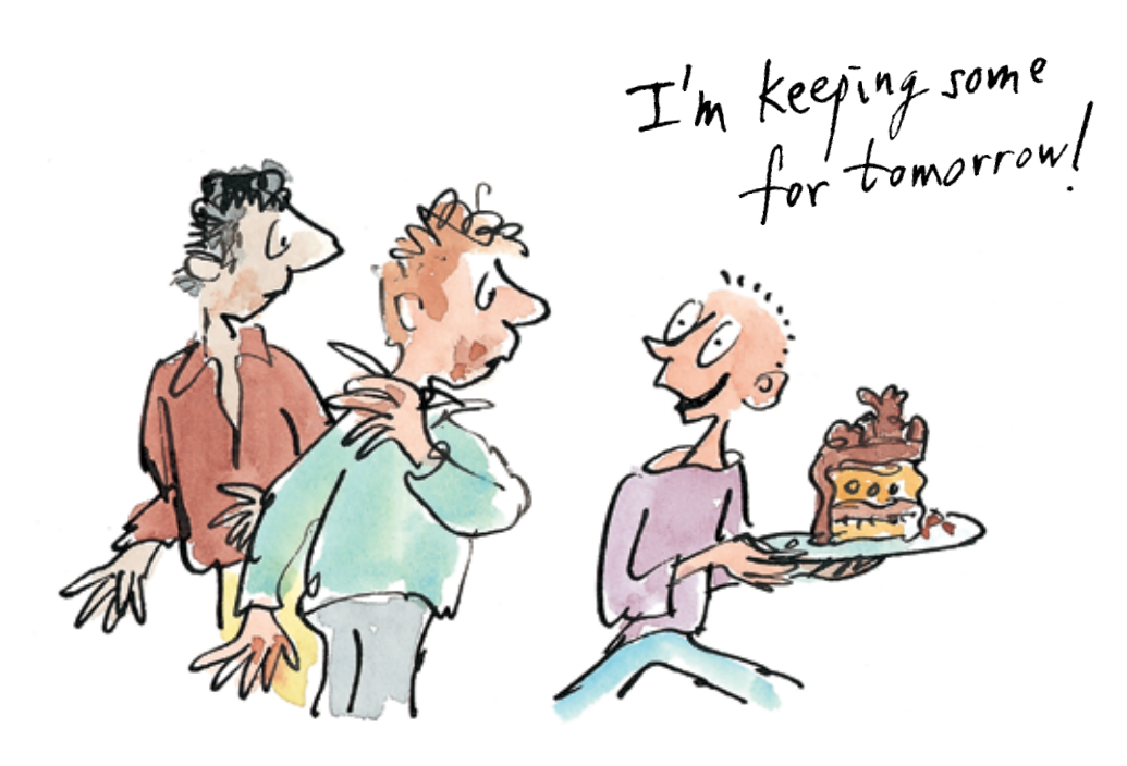
3 The right not to finish a book.